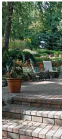
Our thanks to Sargent's Gardens for their LEED-level sustainable landscaping expertise.